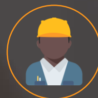
Quevin Oliviera Engineer

4 years+ cabling experience most notably running cat6 cable on various Transport For London sites.