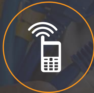
Mobile Signal Boosting