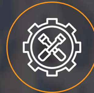
Hardware Installation & Maintenance