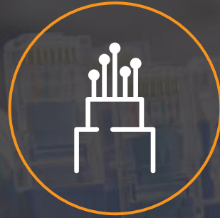
Fibre Optic Cabling